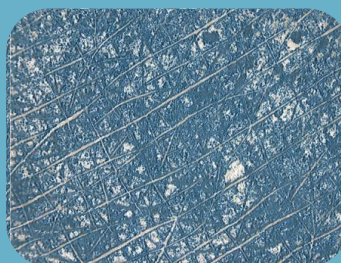
Untreated Skin Before Cleansing Action with Key Ingredient

The Anti-Pollution Cleanser forms a mesh able to entrap PM 2.5 and remove it from the skin surface to prevent and reduce pollution-induced damage.