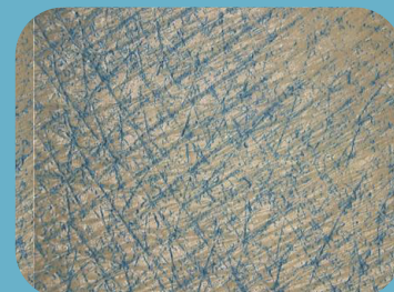
Skin Cleansed with Cleansing Formula Containing Key Ingredient